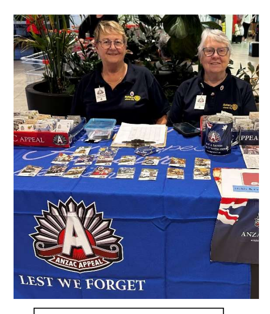
Supporting ANZAC Day