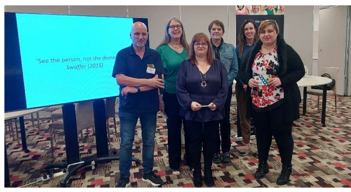
Dementia Alliance Presentation