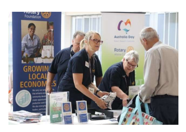
Australia Day Stand