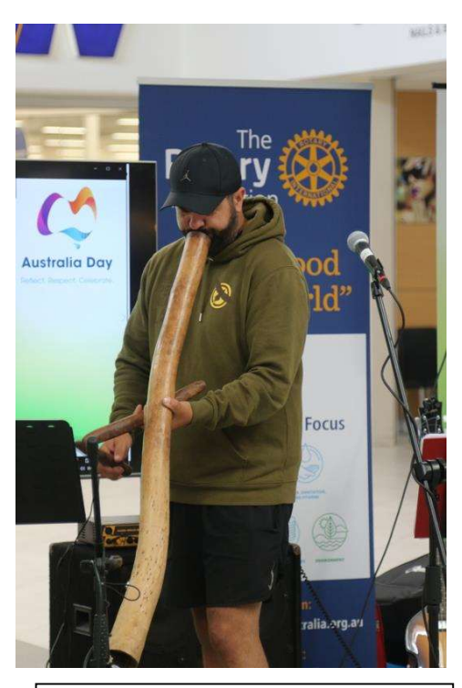
Traditional Didgeridoo Playing