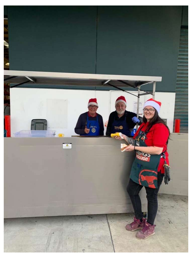
Another Bunnings Sausage Sizzle