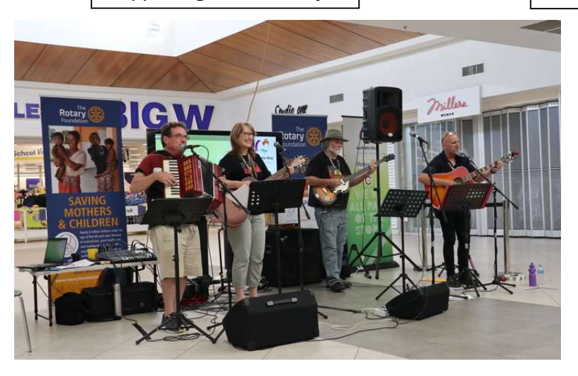
Australia Day Entertainment